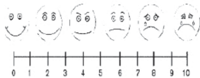
Figure 3. Visual Analog Scale (VAS) 22

pregnancy rhinitis. Pregnancy rhinitis is diagnosed based on subjective findings of symptoms and physical examination. 21