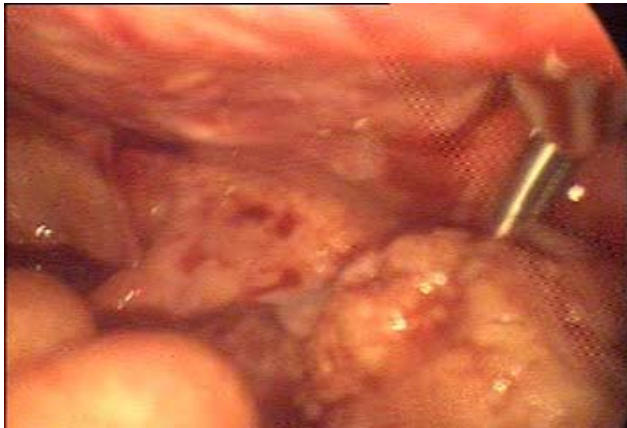
Figure 4. Tumor extraction without endobag.