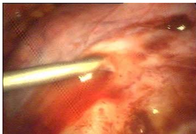
Figure 1. Iatrogenic puncture of the cyst.

intraabdominally as a progression of the cancer. CA125 level rises to 557.