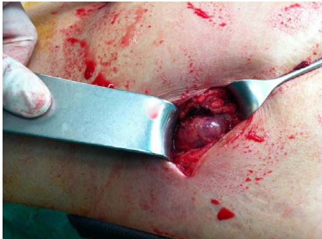
Figure 7. Metastases mass before excision.