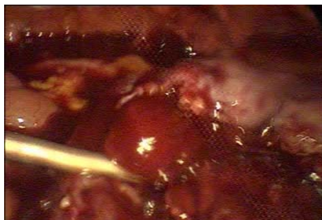
Figure 2. Solid part of the cyst taken for frozen section.