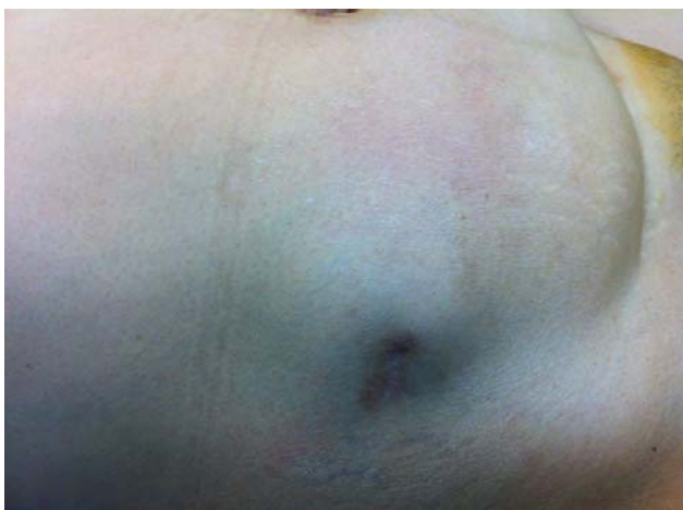
Figure 6. Trocar site metastases.