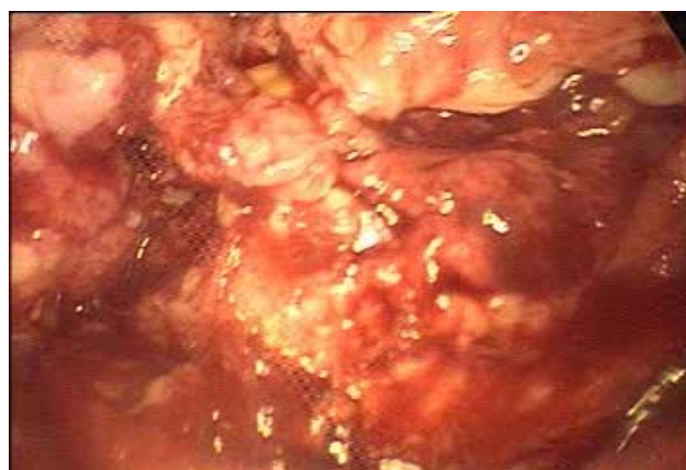
Figure 3. Solid part of the cyst suspicious of malignancy.