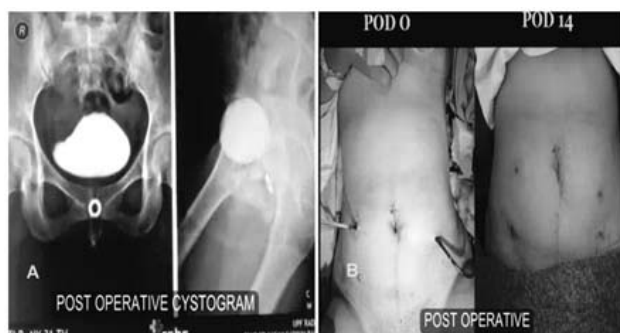
Figure 3. Postoperative results.

The total operative time was 270 minutes, with an estimated blood loss of 50 ml. The patient was discharged on the second post-operative day, with an average VAS score of 2. The urethral catheter was removed at 2 weeks after it was confirmed there was no contrast leakage under cystogram (Figure 3-a). The patient was asymptomatic with normal urination at 3-months follow-up with good cosmetic outcome of the surgical wound (Figure 3-b).