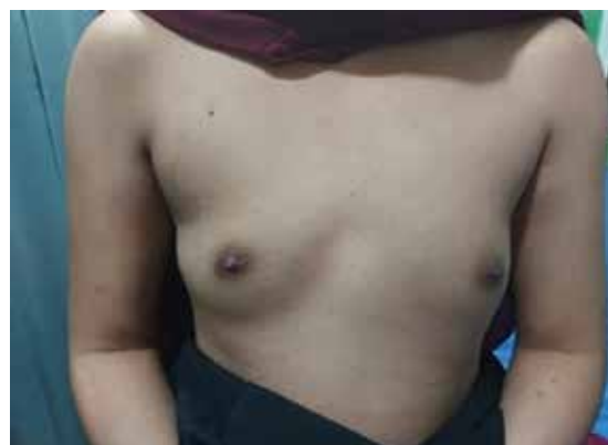
Figure 2. Tanner 2 Secondary Sexual Development Disorder (after therapy)