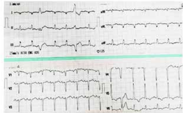
Figure 1. ECG of the patient showed T-wave inversion at III, V5, V6, and aVF right atrial dysfunction, left atrial enlargement, and incomplete left bundle branch block (LBBB), and ventricular extrasystole at I and III

mmol/L), and hypocalcemia. The urinalysis was negative for proteins.