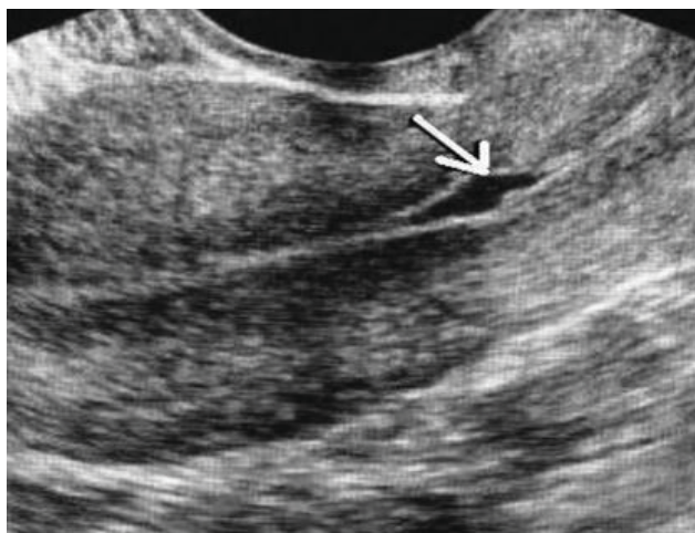
Figure 3. Cesarean scar defect by transvaginal ultrasonography (arrow shows uterine scar defect) 7

In order to evaluate cesarean scar defect with Turan technique can be performed using transvaginal ultrasonography at six weeks post-cesarean delivery with high transducer frequency (5-6 Mhz). The uterine dimension as well as the occurrence of intracavity, parametrial, and subvesical hematoma are assessed. The length of the incision is measured by a transversal axis. The integrity of the incision closure is assessed with transverse and longitudinal axis. The wedge shaped anatomical distortion in scar tissue of the uterine incision definite as uterine scar defect. Evaluation is also performed on the length of the defect. 6