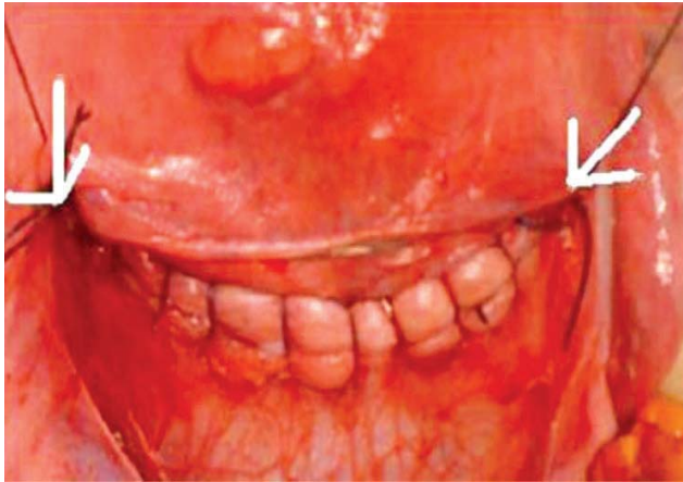
Figure 1. Conventional technique (arrow shows edge of the uterine incision) 6

In order to evaluate cesarean scar defect with Turan technique can be performed using transvaginal ultrasonography at six weeks post-cesarean delivery with high transducer frequency (5-6 Mhz). The uterine dimension as well as the occurrence of intracavity, parametrial, and subvesical hematoma are assessed. The length of the incision is measured by a transversal axis. The integrity of the incision closure is assessed with transverse and longitudinal axis. The wedge shaped anatomical distortion in scar tissue of the uterine incision definite as uterine scar defect. Evaluation is also performed on the length of the defect. 6